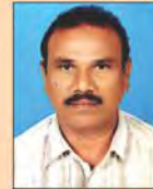
Y. Prasada Rao Pedakurapadu Mandal