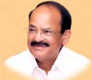
Sri Muppavarapu Venkaiah Naidu Hon'ble Vice President of India